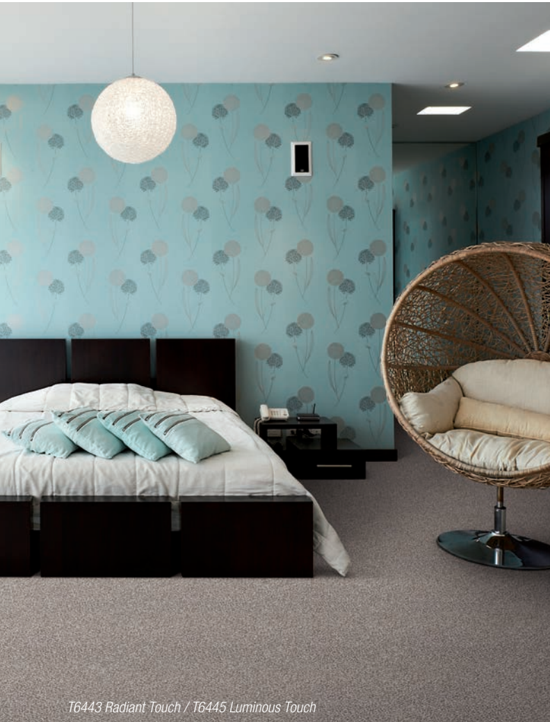
T6443 Radiant Touch / T6445 Luminous Touch