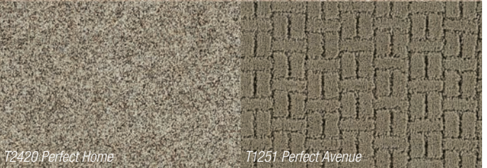
T2420 Perfect Home