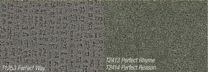
T1253 Perfect Way